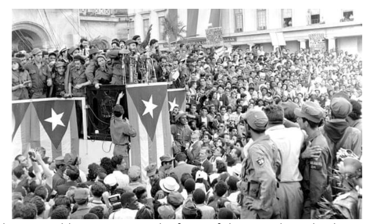
Figure 1: "Fidel Castro addressing a crowd infront of the Presidential Palace in Havana, Cuba, in the year of 1959" 15

included the right to strike. Following these actions, he aligned with the wealthiest landowners who owned the largest sugar plantations and presided over a stagnating economy that expanded the gap between the poor and rich. His corrupt regime began to systematically profit from the exploitation of Cuba's commercial interests by prostitution, gambling and drug businesses in Havana with large multinational American corporations that had invested significant amounts of money in Cuba. Wanting to overthrow this corrupt regime, Castro founded a paramilitary organization called "The Movement". In July 1953, they launched a failed attack on the Moncada Barracks, during which many militants were killed, and Castro was arrested.