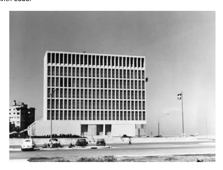
Figure 3: "Building the housed the U.S. Interests Sections in Havana, Cuba" (1963)<sup>25</sup>

At the 16<sup>th</sup> OAS Meeting of Foreign Ministers in San José, that took place in 1975, the group passed the Freedom of Action Resolution<sup>24</sup>. This resolution allowed member-states to resume its relations with Havana and successfully invalidated previous OAS resolutions on Cuba. The island nation was, therefore, able to resume diplomatic relations with most Latin American countries. This decision was seen to be as a key milestone in the reintegration of Cuba to the region. By the late 1980s, majority of Latin American states had normalized relations with Cuba.